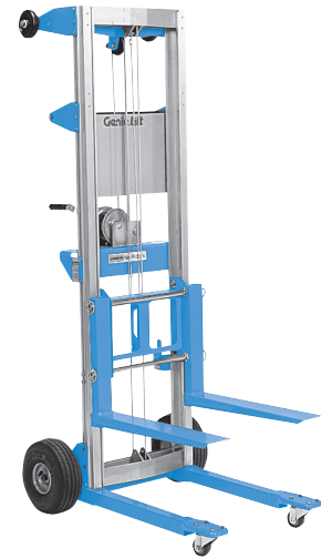
(1) Available aftermarket only